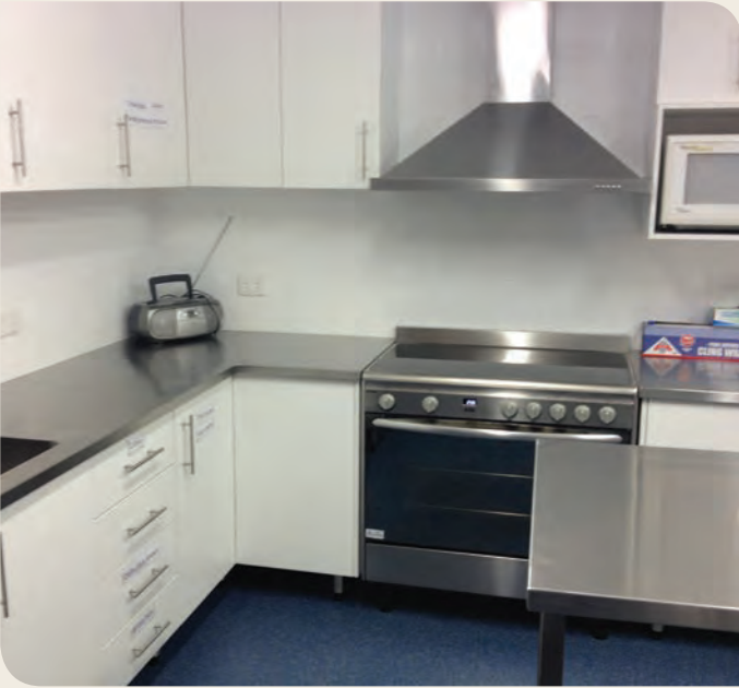
This project has been funded by the Special Rate Variation implemented in 2011/12.