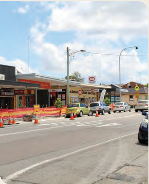
The upgrades in Lawes Street East Maitland are estimated to be finished by the end of 2013

Stage one works have commenced on the upgrade to Woodberry Road, which will include shoulder widening and pavement renewal over a 500m section. There will also be drainage upgrades and an extension of kerb and gutter around Nilands Lane intersection.