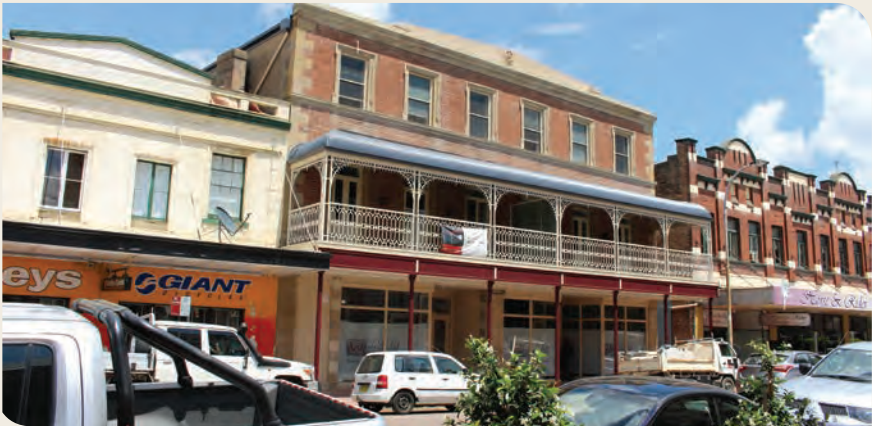
The development at 333 High Street is nearing completion