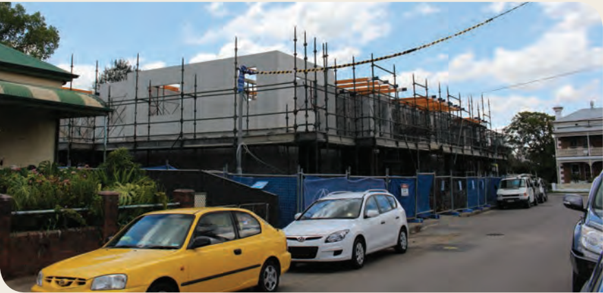
36 apartments are under construction in Steam Street

A 10 unit extension to the Quest Serviced Apartments in Ken Tubman Drive is also a welcome addition and exhibits confidence in the future of Central Maitland.