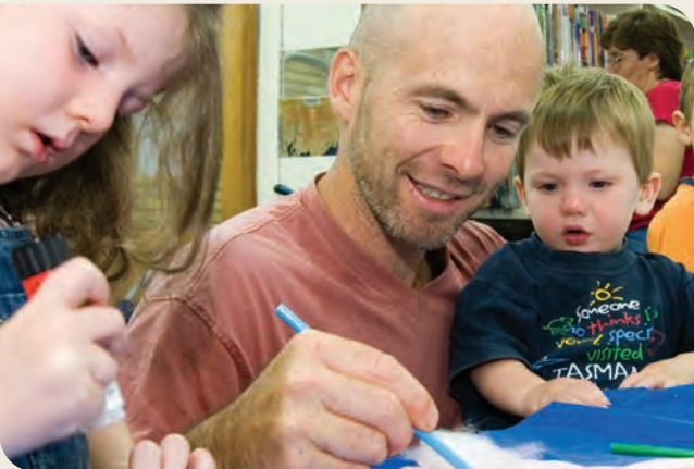
Kid's activities at Maitland City Library

This is just one of the exciting activities planned for the libraries. For the full summer holiday program visit maitland.nsw.gov.au/library