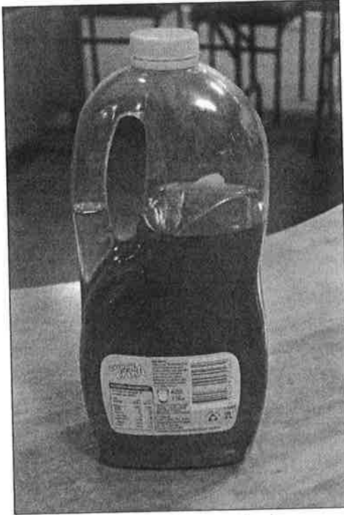
Dirty water from a house in Becker Street was presented to council at last week's special rate variation meeting. It was described as looking like "Coca-Cola".

Cobar Shire Council is investigating possible solutions to Cobar's dirty water problem in response to a complaint last week.