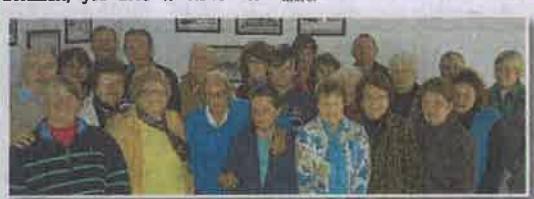
Having a lovely time at a recent Outreach Breakfast was this large crowd at the Albion Hotel. The next breakfast will be held this Sunday November 2nd.

Looking forward to seeing you all there.