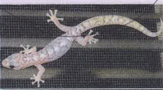
Gecko (House gecko/ Dubious diella)

These geckos are cute and unusual looking, and they're certainly useful to have around. (The arachnophobes friend?)