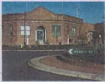
Weddin Shire Council Chambers.