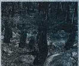
The Xanthorrea Australis