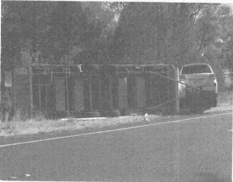
A Victorian couple walked away without injury when their caravan flipped on its side as a result of being passed by a B-Double truck.

A B-Double truck overtaking a four-wheel-drive and caravan forced it off the Newell Highway, 36 kilometres north of Gilgandra last Wednesday morning.