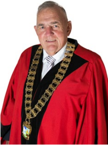
MAYOR COL MITCHELL