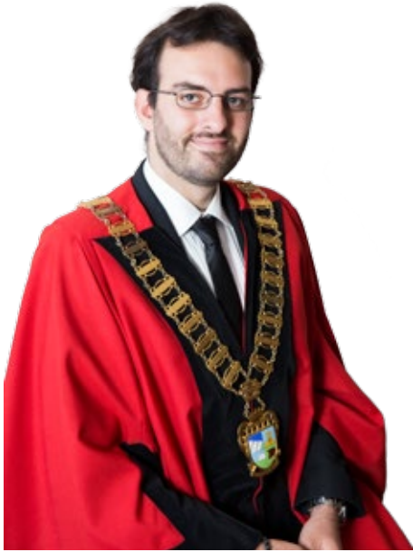
MAYOR BENN BANASIK