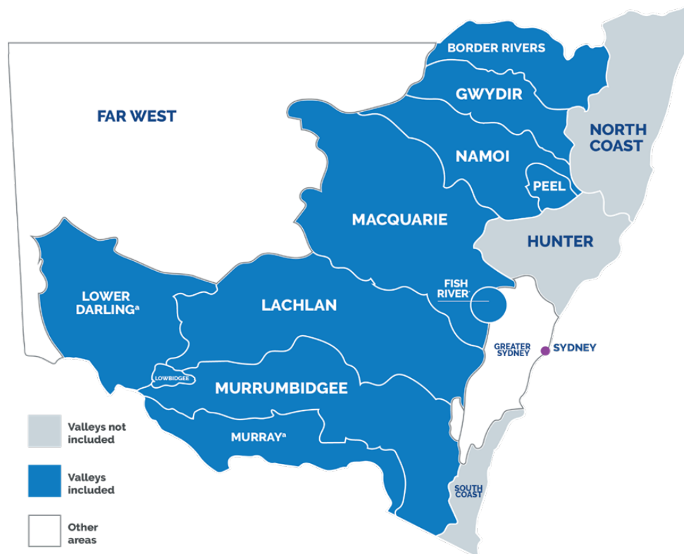
Figure 1 Valleys in and out of the scope of this annual review

Note: This map is not to scale and is for illustrative purposes only. This annual review excludes urban customers in Fish River.