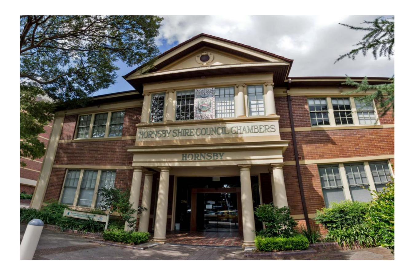
Hornsby Shire Council – Minutes of Workshop Meeting of 23 November 2022