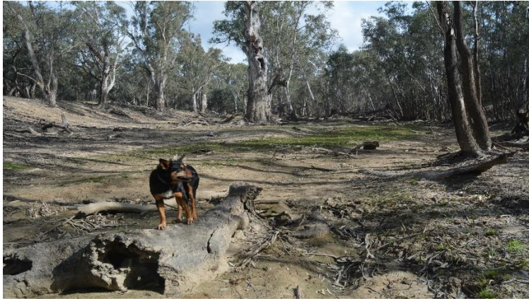
Bullatale Creek August 2024