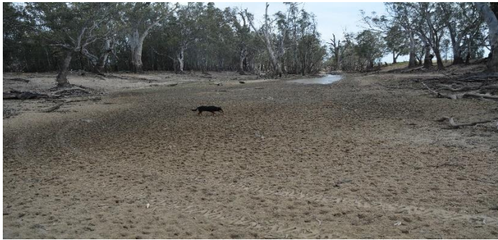
Impacts on irrigation, house water