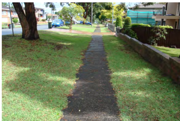
Endeavour St, Sans Souci