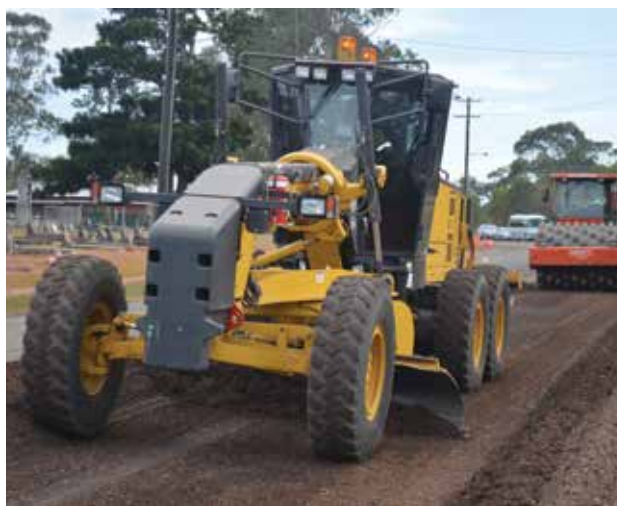
West Street Casino is just one of many local roads to undergo significant reconstruction.

"These specific capital works allocations, in conjunction with ongoing maintenance activities, ensure the continual development and ongoing renewal associated with the safety and condition of our local roads network," he said.