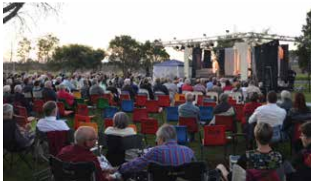
Co-Opera's Die Fledermaus at Windara was well attended by opera lovers in April.