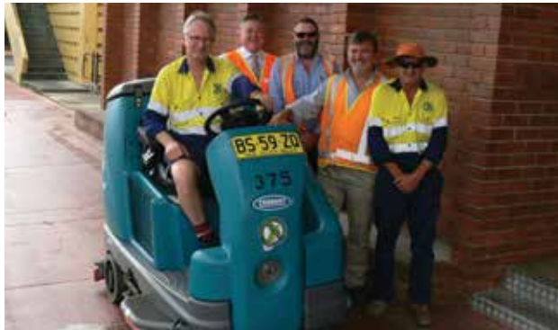
Maintenance crews break in the new street cleaner at the Civic Hall in Casino.

Revalued roads, bridges and footpath assets to decrease the infrastructure backlog by $53 million