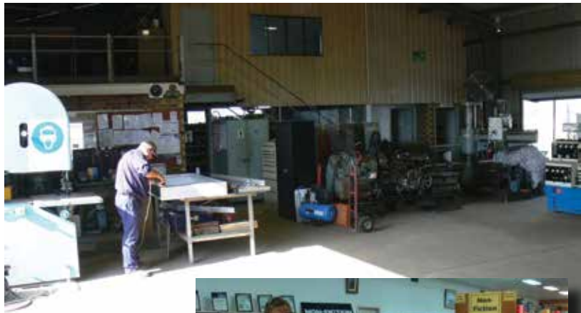
Whether its working in our Coraki Fabrication Plant (above) or one of our community libraries, the key is having pride in our work.

He said he did not want Richmond Valley Council to be an organisation with no clear vision of what its future looked like, nor to be starved of quality employee resources.