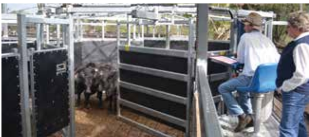
Staff at the Casino saleyards oversee the new pneumatic drafting facility in action.