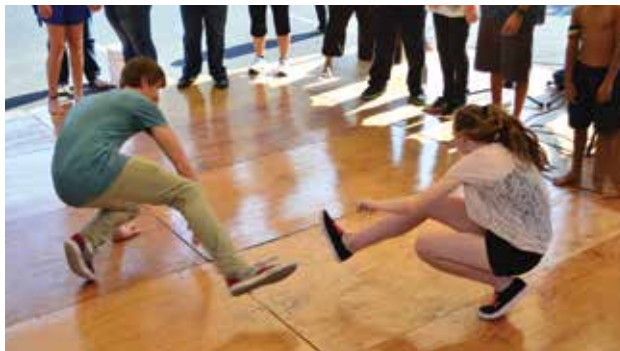
Kids at Crankfest Xtreme got a kick out of learning hip hop at the popular dance stage.