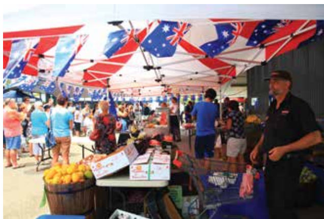
Australia Day in the Richmond Valley is always a spectacular showing of national pride.

Programs and maps will be available shortly on the Australia Day page of www.richmondvalley.nsw.gov.au .