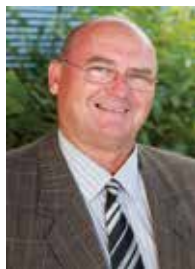
Mayor Cr Ernie Bennett