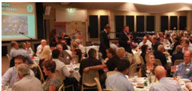
The inaugural economic development luncheon was hailed a success by attendees.