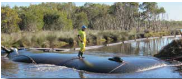
A Salty Lagoon contractor pumps silt out of the channel in preparation for closure.