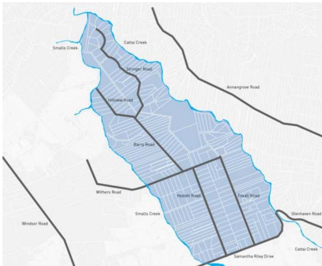
Figure 3.2 North Kellyville Precinct