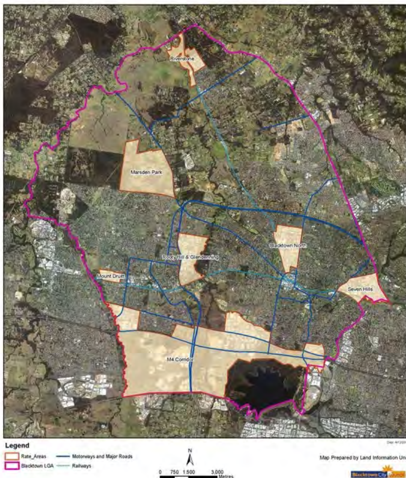
Blacktown City Proposed Business Rates Sub-Categories

For further information please click on the business maps on the right or contact Council here for more information.