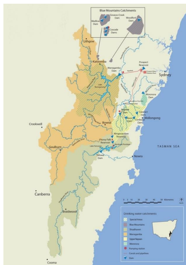
Figure 1. WaterNSW's drinking water catchment areas in Greater Sydney

The proposed prices in the submission apply to WaterNSW's customers in the Greater Sydney region, the area operated by the former Sydney Catchment Authority. Our customers in the Greater Sydney region include Sydney Water, Wingecarribee Shire Council, Shoalhaven City Council and Goulburn-Mulwaree Council. We also provide water supply to some 60 other smaller customers. Figure 1 below shows WaterNSW's drinking catchment area in the Greater Sydney region.